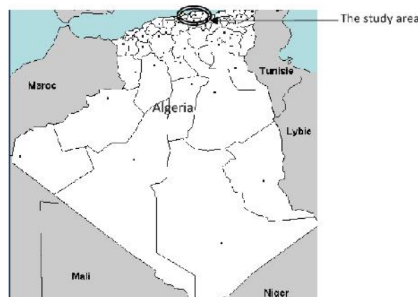
Fig. 1. The test area on the map of Algeria

The most efficient dose was 100 g of oxalic acid is 81% (Table 1), while 70 g of oxalic acid efficiency rate varies between 57 and 87% (Table 2), the dose of 50 g of oxalic acid was 65% (Table 3). Statistical analysis revealed a significant difference between the three treatments (F= 7.87, df= 10, P= 0.002).