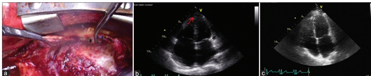
Figure 1: Pericardiectomy in patients with constrictive pericarditis. (a) A patient with constrictive pericarditis undergoing pericardiectomy. *Indicating thick pericardium. (b) Preoperation echocardiography shows enlarged atriums, thick pericardium (as indicated by *) and pericardial effusion (indicated by red arrow). (c) Postoperation echocardiography shows normal atrium without pericardial effusion.

Of the 36 patients receiving surgery, 17 (47%) had concomitant diseases including TB, coronary heart disease, rheumatoid