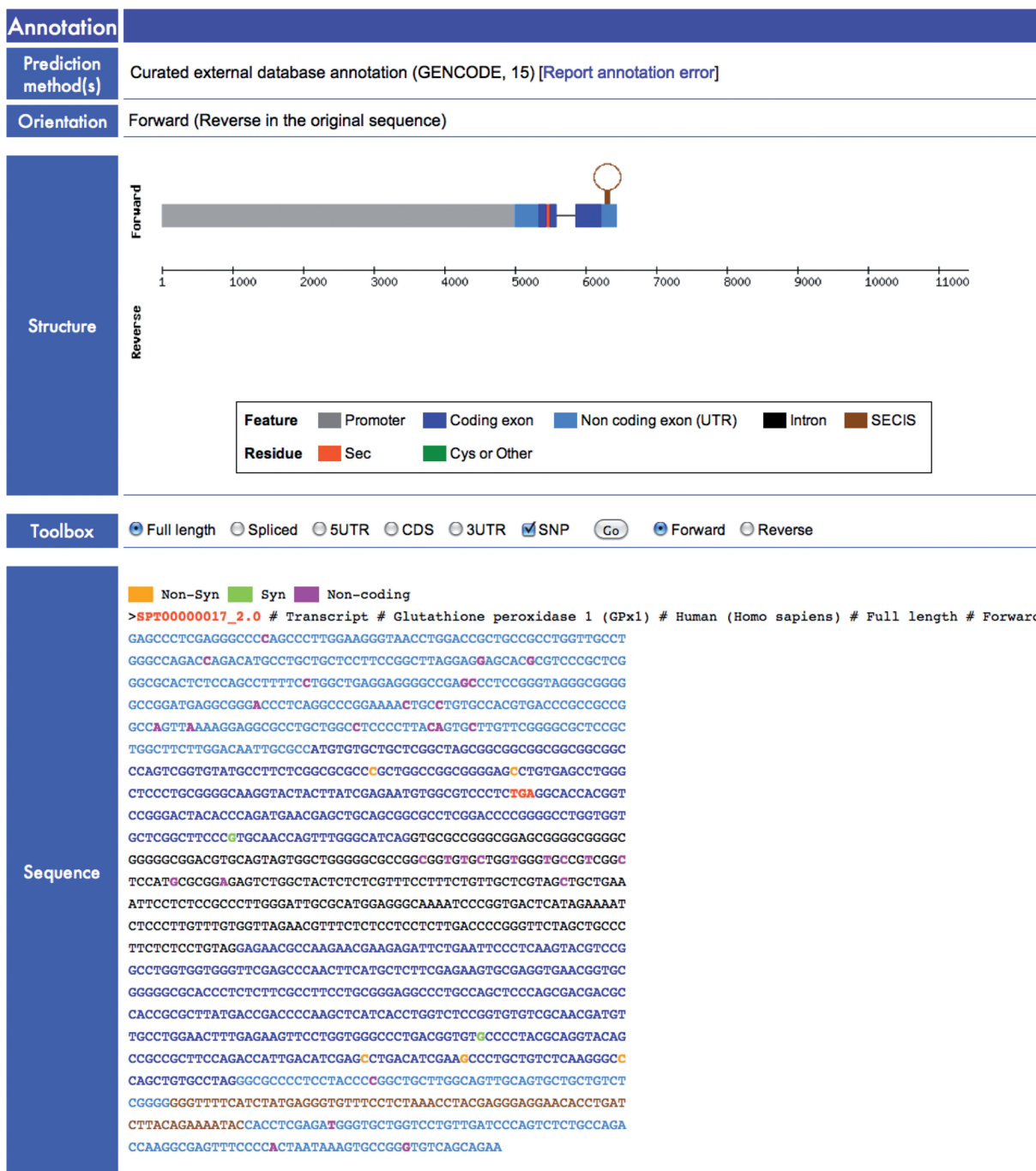
Figure 1. Human glutathione peroxidase 1 (GPx1) transcript. Note the non-synonymous, synonymous and non-coding SNPs annotated in the transcript sequence. The gene structure and transcript sequence is shown in forward despite being annotated in the reverse strand of the reference human genome.

usually lower levels of similarity of the C- and N-terminal between orthologous proteins can result in Selenoprofiles predicting only the central part of selenoproteins in divergent animal genomes (Figure 2).