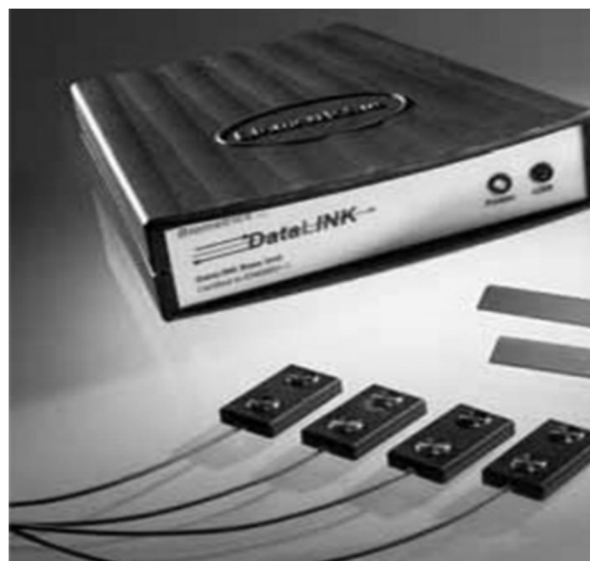
Fig. 2. DataLink surface EMG system and its electrodes

Numerous factors affect the quality of sEMG acquisition such as inherent noise in the electronic equipment, ambient noise in the surrounding atmosphere, motion artifacts and poor contact with skin. The first three factors are dependent on the sEMG acquisition system used and to reduce the effects of these, a DataLINK (Biometrics Ltd; UK) sEMG