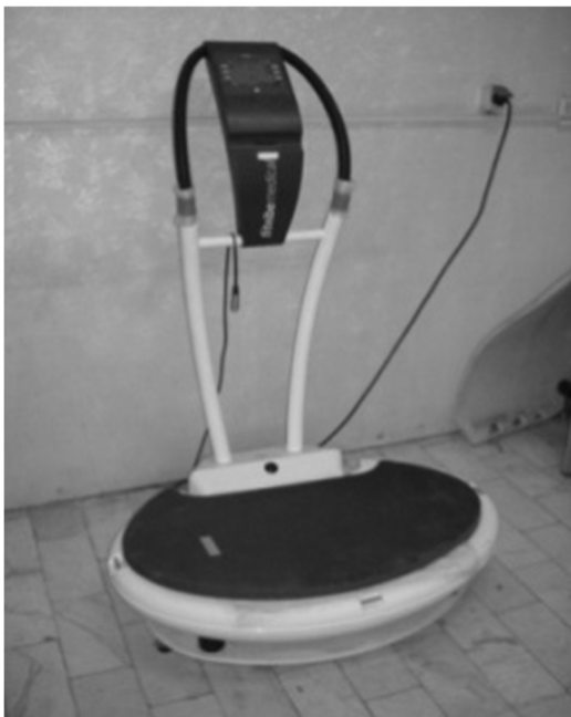
Fig. 3. Fitvibe vibration system.

After the electromyographic activity capture, the RMS value of the EMG signal was used as a means for measuring the amplitude of the voluntarily elicited EMG signal. The RMS values, as the preferred method of normalization, were measured at the peak of activity during MVIC of the muscles (31).