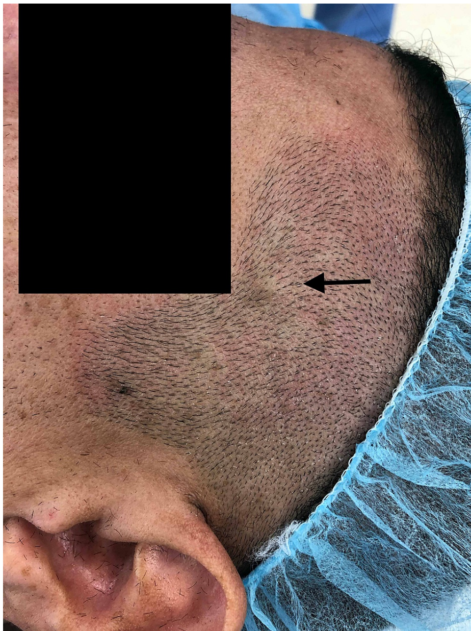
FIGURE 1: Pulsatile Left Temporal Mass (Arrow) Preoperative Image

prior resulting in a subsequent 100 lb weight loss. The patient had worked as a flight attendant for the last 25 years on both short and long-haul flights. He denied a history of other aneurysm, hernia, connective tissue disease, or any past trauma to the head. Examination confirmed a pulsatile 1 cm mass overlying the left forehead just within the hairline. Prehospital imaging with computed tomographic angiography confirmed the presence of a fusiform anterior temporal artery aneurysm measuring 6 mm. The patient reported significant anxiety regarding aneurysmal degeneration and the potential for aneurysm rupture while in flight given his profession. The decision was made for surgical management.