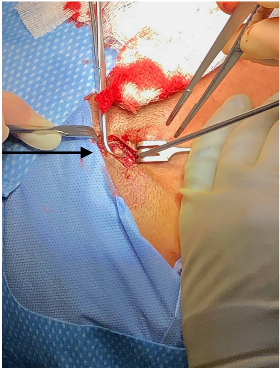
FIGURE 2: Anterior Superficial Temporal Artery Aneurysm In Situ (Arrow)

Proximal and distal control with right angle instrument, enabling further dissection without blood loss.