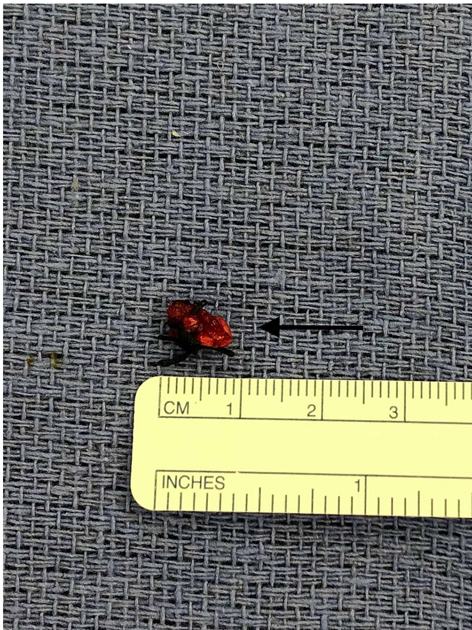
FIGURE 4: Anterior Superficial Temporal Artery Aneurysm Gross Specimen (Arrow)