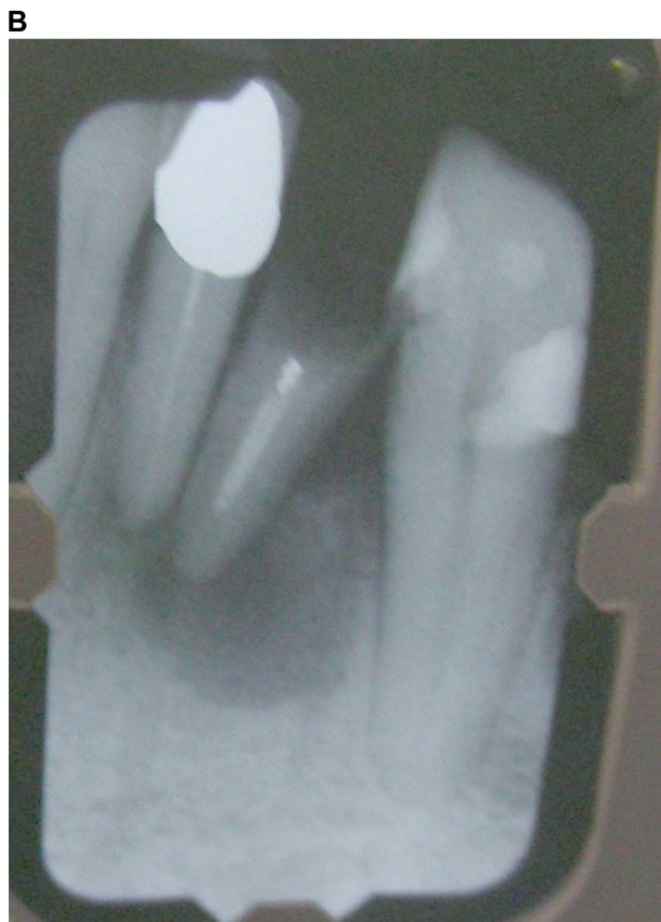
Figure 2 A) Cutaneous sinus tract on the chin of case no. 2 patient. B) Periapical radiograph demonstrating failing root canal therapy of mandibular anterior tooth.

The patient was referred to Oral and Maxillofacial Surgery for the extractions of the noted problematic teeth. The extraction procedures were routine and the patient was lost to follow-up.