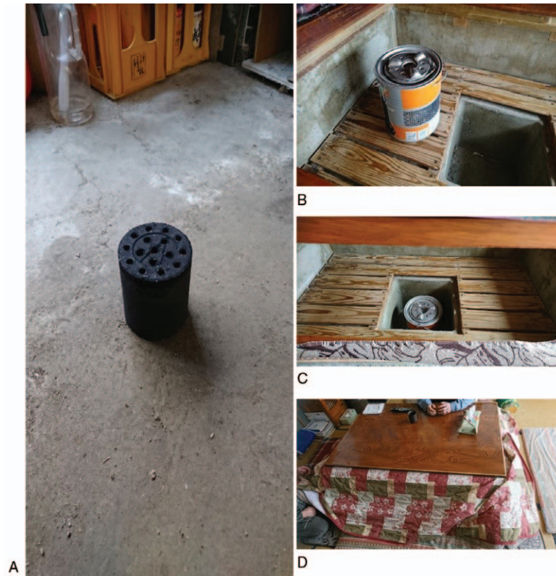
Figure 1. Kotatsu system. The briquette (A) is put into a specialized container (B) and placed in a hole made in the floor at the bottom of a kotatsu system (C). A table is then placed above and covered with a quilt, and people sit with their feet and legs under the table (D).

development of DNS, including a broad spectrum of neurological deficits, cognitive impairments, and affective disorders. [3] However, the mechanisms underlying DNS remain unclear. Briquettes are a source of CO and have been reported to be involved in suicide cases [4] and accidental cases [5] of CO poisoning. In Japan, briquettes have historically been used as a fuel source in kotatsu, a traditional heating system for the winter season, unique to that country. Briquettes are inexpensively available for bulk purchase from home centers and on the internet, and have a continuous burning-time of about 8 hours.