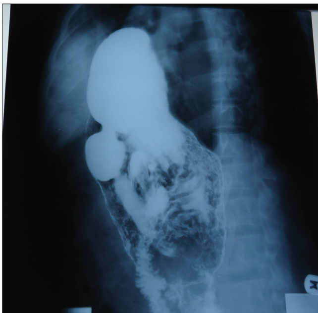
Figure 1: A contrast study showing the outline of the stomach in the chest

This is a retrospective case series of TDI in two tertiary institutions in the country. TDI is a relatively rare condition, and there is a high tendency for it to be missed if thorough clinical assessment and imaging review are not carried out, and the absolute number of TDI is dependent on the overall number of chest trauma; the number of cases of TDI (is directly proportional to the incidence of chest trauma) tends to increase as the number of chest trauma increases. [14] The incidence of TDI in patients with chest trauma ranges between 1.3% and 6.5% [14,15] and about 54.2% of those had thoracotomy following chest trauma from our recent review. [16] The incidence of 4.3% from this series is similar to the 6.5% reported by Adegboye et al. about two decades ago. [15] The implication is that TDI following truncal injuries is quite uncommon, and thus attending emergency physicians should be alert to identify any of