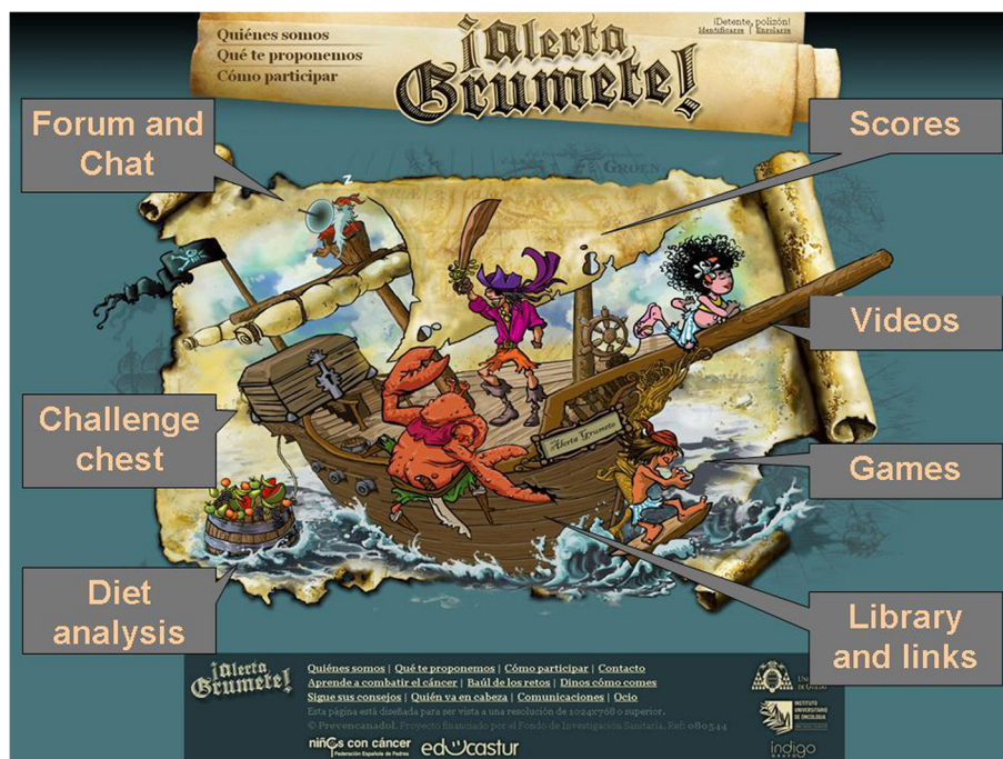
Figure 2 Home page and sections of Prevencañadol program website.