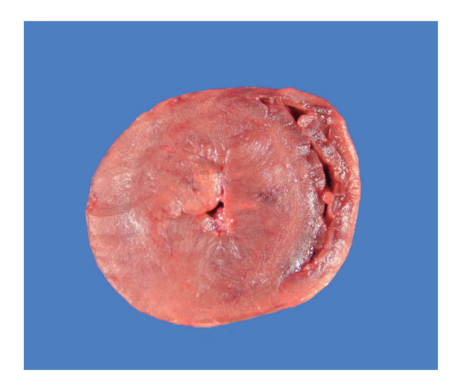
Figure 2. A gross pathology specimen from a 5-year-old cat with hypertrophic cardiomyopathy. The heart is shown in a transverse plane at the level of the papillary muscles in the left ventricle. Severe concentric left ventricular hypertrophy is evident with dramatic reduction in the size of the left ventricular lumen.

tract obstruction is observed), ACE-inhibition, and antiplatelet drugs. Some promise with novel, targeted therapies is on the horizon as sarcomeric modulating drugs are being investigated. The feline HCM model has already served as a bridge between research in rodents and human clinical trials with one such novel drug trial in cats with HCM [10]. Beta receptor and ACE gene polymorphisms are described in cats and their role in the response to therapy and progression of HCM, and provide another opportunity for interdisciplinary research.