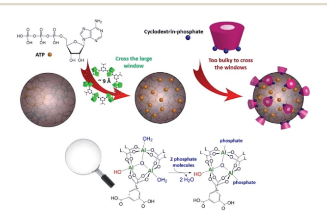
Fig. 1 Upper panel: schematic representation of the highly porous MIL-100(Al) nanoparticles loaded with ATP and then coated with CD-P. Bottom panel: close up of Al trimers coordinated to trimesate ligands (L). Two molecules of bound water can be replaced either by phosphates from the drug or by phosphate grafted on the cyclodextrin molecules. Phosphates bound to CD can only access sites located close to the external MOF surface. CD dimensions: cage 6–6.5 Å, external diameter 15.4 Å, height ~8 Å. ATP molecule has about 7 Å radius.

In the past decades, magic-angle spinning (MAS) solidstate nuclear magnetic resonance (ssNMR) spectroscopy, sensitive to short-range order, has proven an essential technique to get information about the structure of MOFs,<sup>6</sup> including drug-carrier MOFs.<sup>7</sup> Although it appeared ideally suited to address the questions mentioned above, we faced the presence of strong paramagnetic centers (Fe<sup>3+</sup> cations)