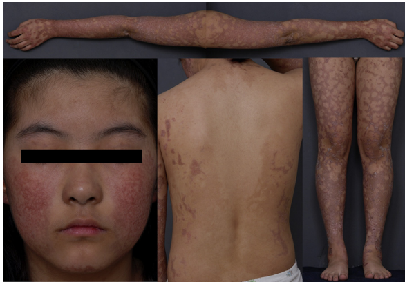
Fig 1. Poikiloderma in a patient with RTS. Reticulated telangiectatic erythematous patches with brownish pigmentation are seen on the face and extremities, sparing the trunk.

exome sequencing found 2 novel heterozygous variants in the RECQL4 gene, confirmed by Sanger sequencing: an intronic variant, NG_016430.1 (NM_004260.3):c.2059-3C>G and a missense variant, NM_004260.3:c.3042C>A (p.His1014Gln) (Fig 3). Through targeted Sanger sequencing of samples from her parents, a transconfiguration of the 2 detected variants was confirmed. In silico analysis of the c.2059-3C>G variant found a possible damaging effect on the protein structure, confirmed by LoFtool. Moreover, using targeted exome sequencing, a novel heterozygous missense variant c.1627G>A (p.Val543Met) in the FERMT1 gene was also identified.