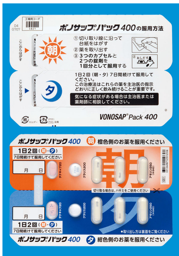
Fig. 1 Vonoprazan triple-drug blister pack (VONOSAP®): Contains vonoprazan, clarithromycin, and amoxicillin (from left to right)

Additionally, medicines to be taken in the morning and evening are color-coded in the center. In a retrospective study looking at lansoprazole triple therapy, the eradication success rate was higher in the triple-drug blister pack group than in the separate-tablets group [23]. Conversely, the eradication success rate was the same in another retrospective study that examined vonoprazan triple therapy [24]. Moreover, there was no significant difference between the two groups in RCTs [25, 26]. It is possible that the RCTs were affected by the Hawthorne effect because not only the blister pack group but also the separate-tablets group had good compliance; therefore, the full impact of the combination blister pack on the success rate of clarithromycin triple therapy remains unclear. It has been hypothesized that the launch of the vonoprazan triple-drug blister pack in June 2016 increased the proportion of