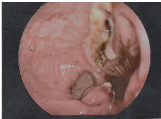
Fig. 2 Endoscopic caption of the ulcer in sigmoid anastomosis, after reposition of the drain into the peritoneal cavity.

migration of a Jackson-Pratt catheter into the region of the anastomosis in 1.6% of the patients who underwent transhiatal esophagogastrectomy, equal to 7% of the patients who developed an anastomotic leak, as a postsurgical complication. The study highlighted the need of drain withdrawal or removal to facilitate healing of the anastomotic leak. 13