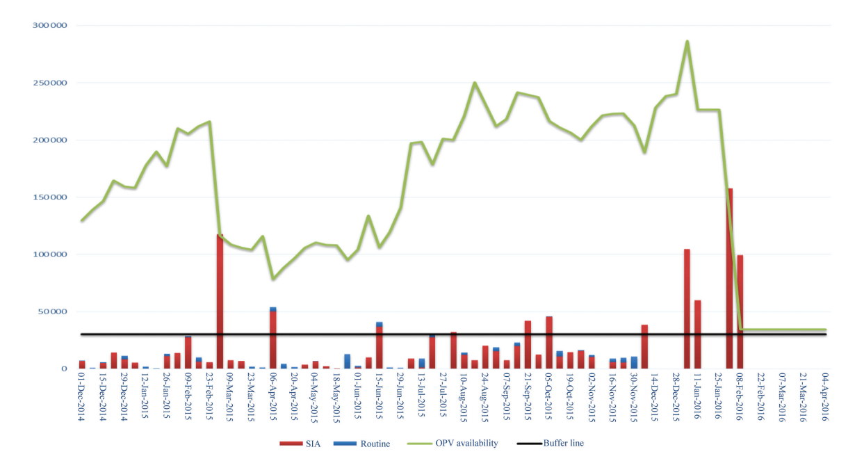
Figure 2. Projected cumulative supply balances as of October 2015 for April 2016. Abbreviations: OPV, oral poliovirus vaccine; SIA, supplementary immunization activity.

also discussed and agreed in principle to coshare with vaccine manufacturers financial losses within a certain financial budget for contracted residual stocks of tOPV at the time of cessation, should manufacturers request such compensation.