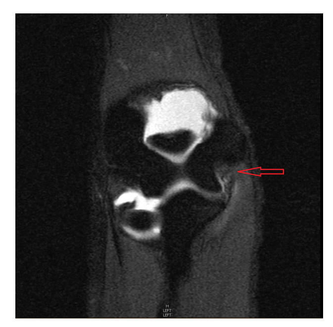
Figure 4 Left elbow MRI with contrast demonstrating high-grade proximal tear of the UCL. (TI fat-suppressed 1.5T coronal image). Note: Arrow points to the exact site of UCL injury. Abbreviation: UCL, ulnar collateral ligament.

The prevalence of UCL injuries in gymnasts is not known. There are three retrospective studies in the literature that