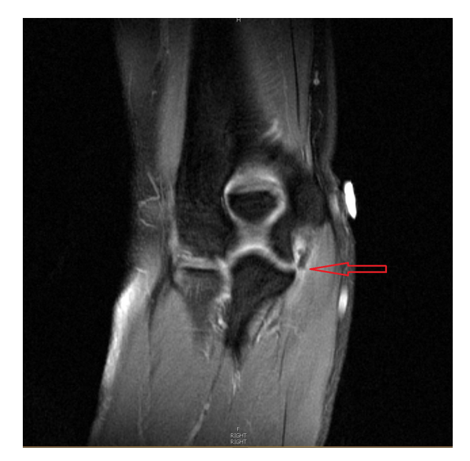
Figure 5 Right elbow MRI with contrast showing complete tear of the UCL distally. (TI fat saturated I.5T coronal image). Note: Arrow points to the exact site of UCL injury. Abbreviation: UCL, ulnar collateral ligament.

discuss surgical outcomes in gymnasts with UCL injury but include sample sizes of 2–4 gymnasts and are not specific about return to play.<sup>7–9</sup> One case report has been published on a gymnast with a boney avulsion of the UCL in the elbow after a dislocation.<sup>10</sup> Much more, however, is known about UCL injuries of the elbow in the throwing athlete.