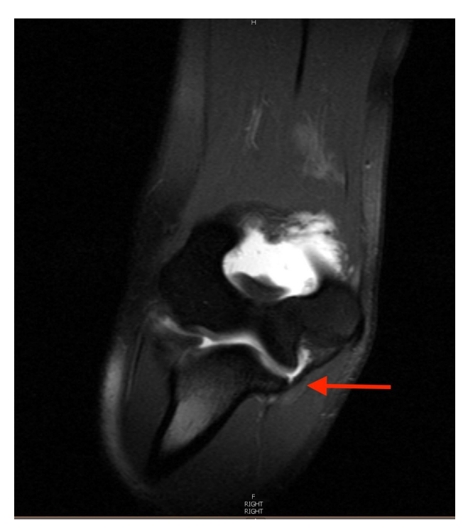
Figure 2 Right elbow MRI with contrast showing partial tear of UCL distally with old proximal UCL injury suspected (T1/fat suppressed 1.5T coronal image). Abbreviation: UCL, ulnar collateral ligament.