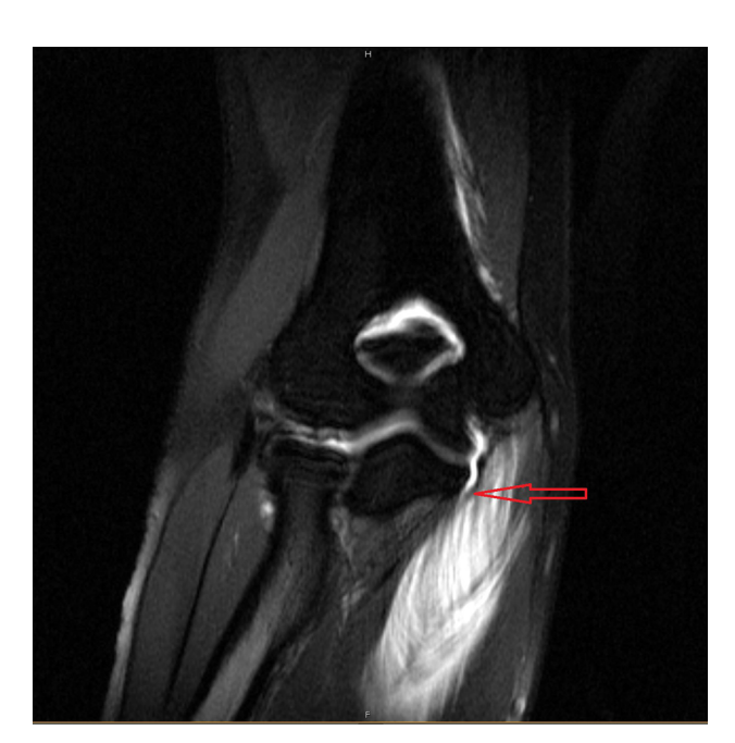
Figure I Right elbow MRI with contrast showing distal UCL injury and extravasation of contrast (TI/fat suppressed 1.5T coronal image). Note: Arrow points to the exact site of UCL injury. Abbreviation: UCL, ulnar collateral ligament.

A 19-year-old female with a history of elbow pain presented for evaluation after feeling a "pop" in her right elbow while