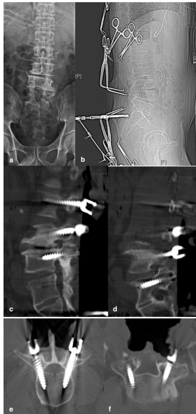
Figure 2. A 55-year-old male patient with post-laminectomy instability and spinal stenosis; X-ray (a) showed previous laminectomy of L4, L5 and partial L3. This patient underwent revision spinal surgery with the use of iCT-navigation; X-ray (b) showed the reference array fixed at the spinal process of S1 for iCT-navigation. Intraoperatively, after all screws were inserted, the confirmatory CT scan demonstrated sagittal and axial views of screws (c,e) at the virgin site and (d,f) at the revision site.