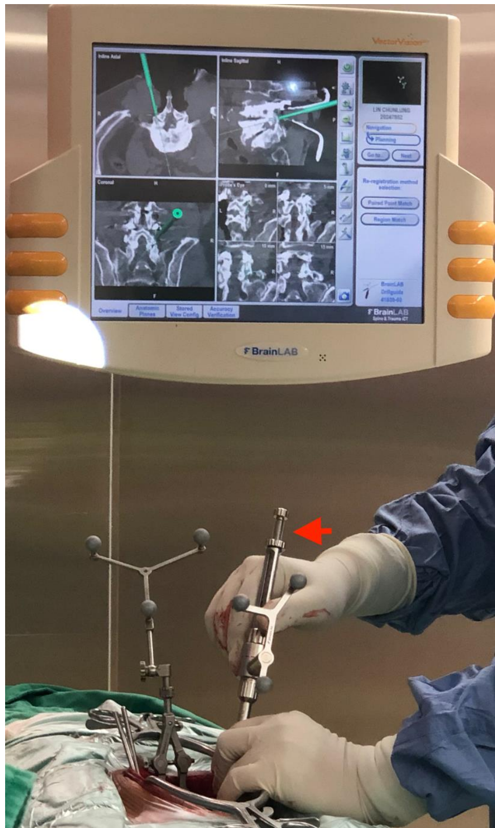
Figure 1. The straight drilling guide (red arrow) was used to guide a 2.7 mm in diameter drill bit to create the optimal TPS track under iCT-navigation by checking the axial, sagittal and coronal views.