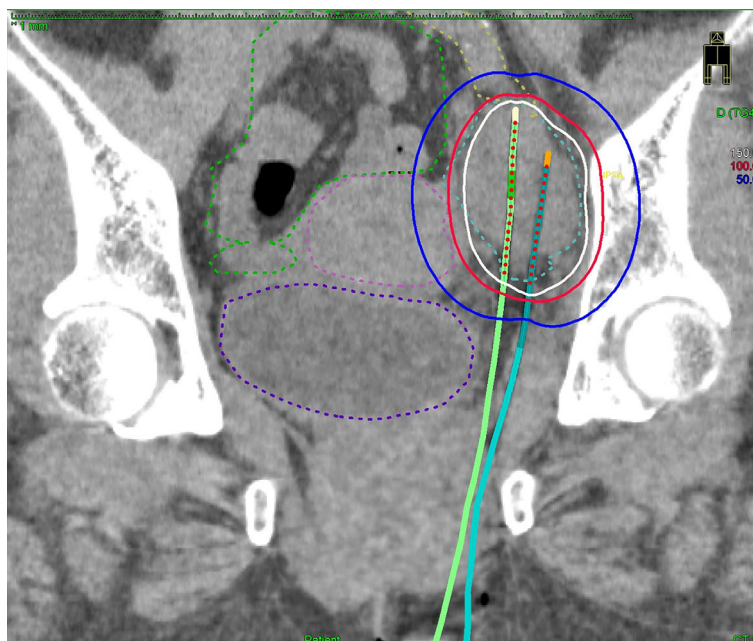
FIGURE 2 | A coronal CT image of the bulkiest obturator node (blue dashed line), uterus (pink dashed line), bowel (green dashed line), external iliac vessel (yellow dashed line), bladder (purple dashed line) receiving 50% (blue lines), 100% (red lines), and 150% (white lines) of the prescription dose (6 Gy) from two implanted needles.