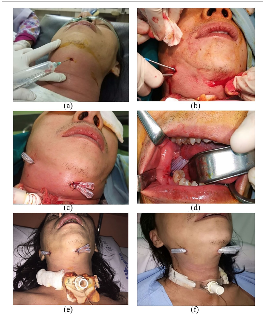
Figure 2. (a) Pus needle aspiration, (b) bilateral incision and drainage, (c) Penrose drain placement at submandibular and submental area, (d) Penrose drain placement at sublingual area, (e) postoperative condition—day 1, and (f) postoperative condition—day 5.

Ludwig's angina, especially when another fatal complication such as septic shock is present.