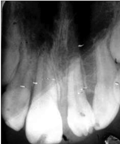
Figure 3: Using light traction with elastics, the mesiodens was gradually guided to the position of the missing central incisor.

rightfully assessed in the radiographic series, the root of the permanent incisor was rudimentary and dilacerated and narrow with a possibility of cessation. Aesthetic restoration of the mesiodens was carried out with anterior composites (Figure 5).