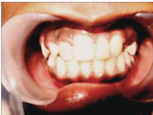
Figure 5: Aesthetic restoration of the mesiodens was carried out with anterior composites.

The patient was extremely satisfied with her appearance after the treatment. After eruption of the permanent left canine, adjunctive procedures may be appropriate to distalize the left lateral incisor with fixed orthodontic therapy to accommodate a crown as large as the adjacent central incisor, for better aesthetics.