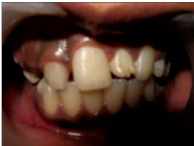
Figure 4: Using light traction with elastics, the mesiodens was gradually guided to the position of the missing central incisor.