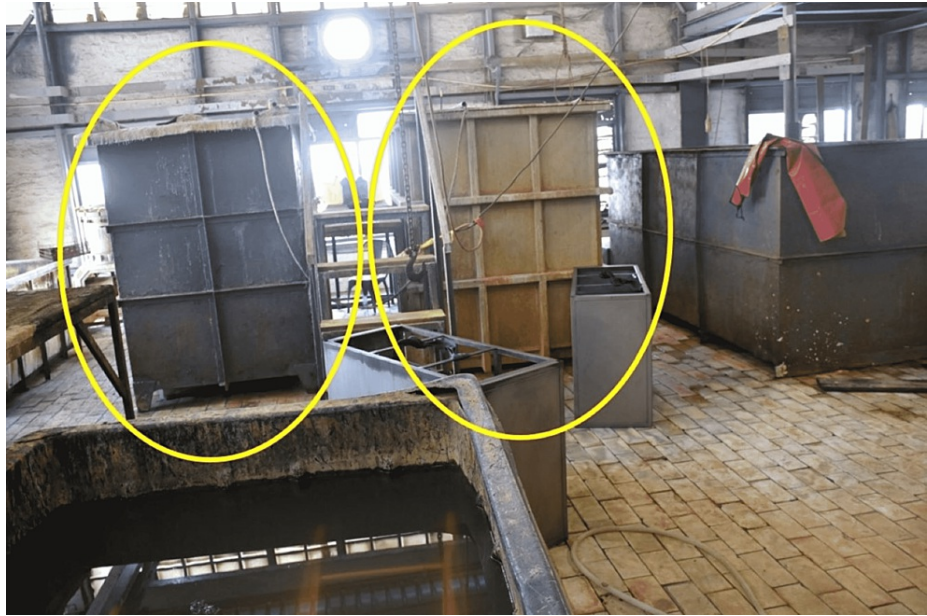
FIGURE 1: Scene of the incident where electroplating chambers were used in the process of electroplating (yellow circles)

On the fateful day, two workers were cleaning the electroplating tank. One of them got into the tank, and another person helped him by giving him the cleaning material. Upon entering the tank, the first worker suddenly fell unconscious and did not reply to the second worker's call. The second worker entered the tank and fell unconscious too. The other two co-workers working nearby came to the rescue, and they also fell unconscious in the tank. All four were immediately transferred to a nearby hospital. Out of the four, three were declared dead when they were brought to the hospital, while one was admitted and later discharged healthy after two days.