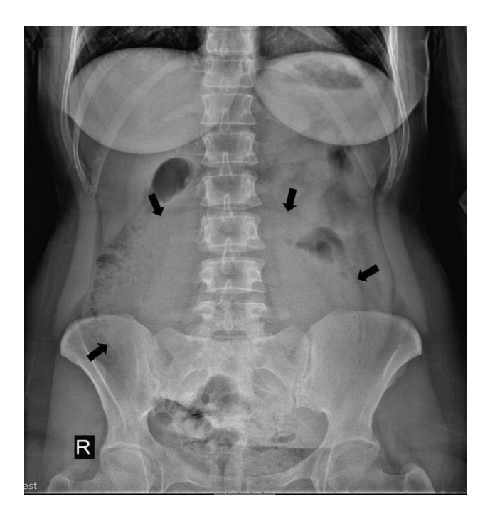
Fig. 1 – Abdominal radiograph shows a barely perceptible, centrally located soft tissue mass.

The pain was constant and localized into whole abdominal quadrants. Physical examination revealed marked tenderness in whole abdomen. The patient had a history of ectopic pregnancy operation seven years ago. Her laboratory tests including white blood cell count and C-reactive protein were in normal limits. Abdominal radiograph showed a centrally located soft-tissue mass (Fig.1). US showed a well-defined cystic mass with distinct hyperechoic wavy structures causing intense posterior acoustic shadowing (Fig. 2). An enhanced abdominal CT scan was performed subsequently. CT revealed an ovoid mass measuring 20 cm in diameter with an enhancing capsule in the umbilical region containing wavy striped high-density areas (Fig. 3). Intraabdominal tumor, abscess and gossypiboma were considered in the differential diagnosis. After the surgical consultation, operation was decided. At exploratory laparotomy, a well-circumscribed firm mass was detected with extensive adhesions to a loop of the small bowel posteriorly (Fig. 4). Numerous adhesions were released, and the pelvic mass was excised with the adherent small bowel and its mesentery. In pathology evaluation, the diagnosis of gossypiboma was verified.