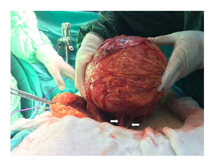
Fig. 4 – At exploratory laparotomy, a well-circumscribed firm mass was found with extensive adhesions to a loop of the small intestine posteriorly (arrows).

Cotton laparotomy sponges can lead to two foreign body reactions when left behind in the human body [6]. The first type is a septic reaction with an exudative response. The human body tries to expel the foreign material either externally or into a hollow viscous creating a fistula or abscess [1]. Patients with this type of reaction are usually symptomatic in the early postoperative phase and require immediate surgical interventions. The second type is an aseptic fibrinous reaction resulting in adhesions, encapsulation and, ultimately, foreign body granuloma formation [6]. This type of reaction is usually clinically silent and may remain inactive for many years after the initial surgery [7].