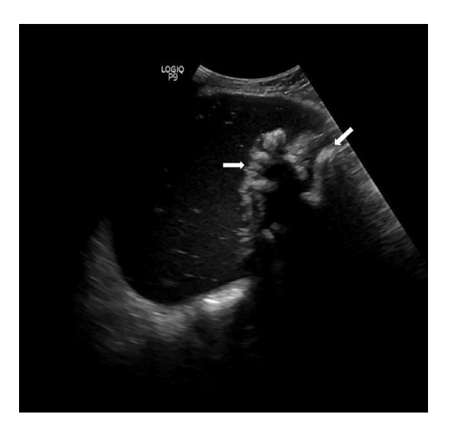
Fig. 2 – Transabdominal ultrasound demonstrates a well-defined cystic mass with distinct hyperechoic wavy structures (arrows) causing intense posterior acoustic shadowing.

Wilson reported the first case of a gossypiboma in 1884. Since the beginning of the twentieth century, it has been recommended to use radiopaque sponges to prevent the gossypiboma cases [4]. Theatre 'swab counts' at the end of a procedure before 'closing up' are typically undertaken to prevent re-