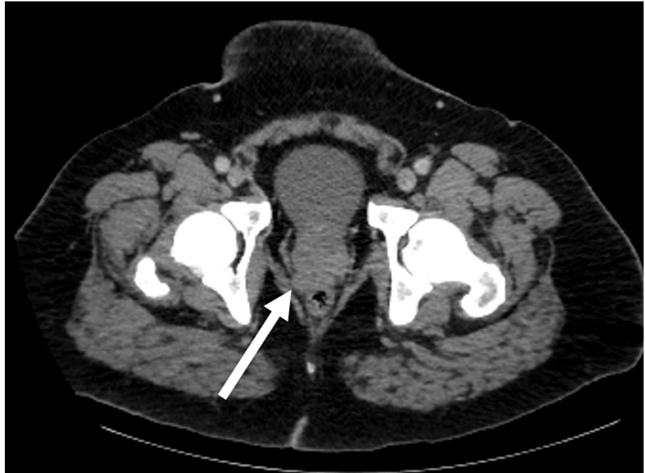
FIGURE 1: Axial CT scan of pelvic region

There is mild bulging along the right posterior prostate base and seminal vesicle (white arrow) which may reflect the primary tumor.