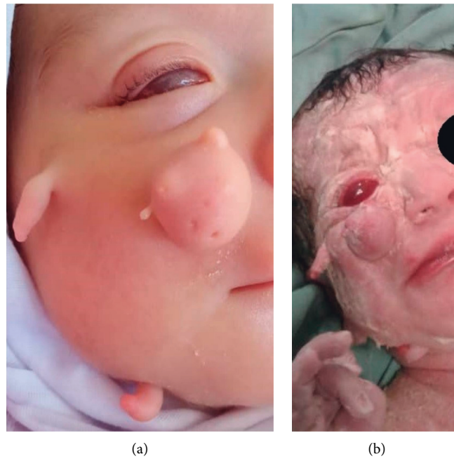
FIGURE 1: Multiple cutaneous appendages on the right side of the face and a fleshy mass under the right eye.