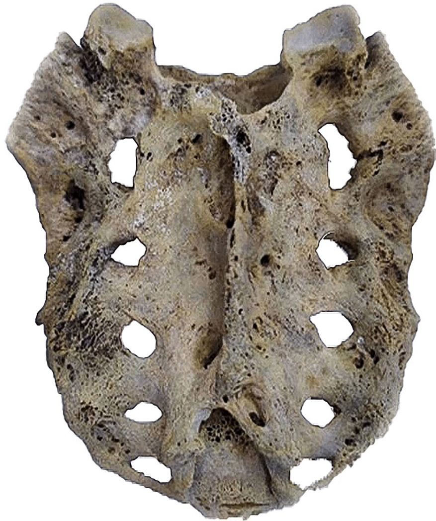
FIGURE 5: Illustrating Dorsal Surface of Sacrum With 05 Pairs of Sacral Foramina.