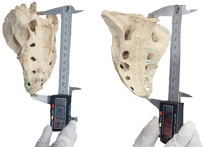
FIGURE 2: Illustrating measurements of sacralized bone on both ventral and dorsal surfaces utilizing digital slide calipers.