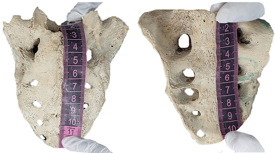
FIGURE 1: Illustrating measurements of Sacralized bone on ventral and dorsal surfaces utilizing measuring tape.

Measuring tape (Figure 1) and digital slide calipers (Figure 2) are the tools used for data collection. Data are collected with the help of digital slide calipers along the mid-line of the sacrum from the middle of the anterosuperior margin of the promontory to the middle of the anteroinferior margin of the last coccygeal vertebra. It was recorded in millimeters, and the curved length of the sacrococcygeal vertebra was recorded using flexible ribbon tape. The current study also determines the sacrococcygeal curvature index (SCI). SCI is assessed through "sacrococcygeal straight length divided by sacrococcygeal curved length \times 100 " [59].