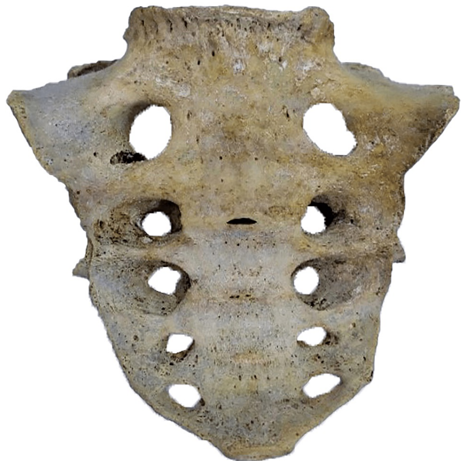
FIGURE 4: Illustrating Ventral Surface of Sacrum With 05 Pairs of Sacral Foramina.