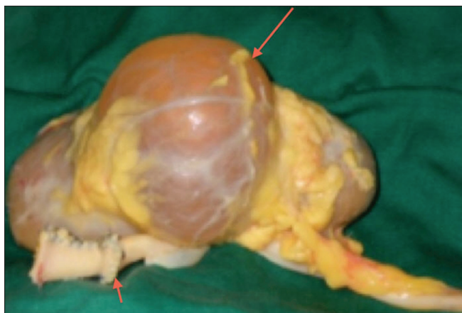
Figure 1: Large simple cyst in the deceased donor kidney