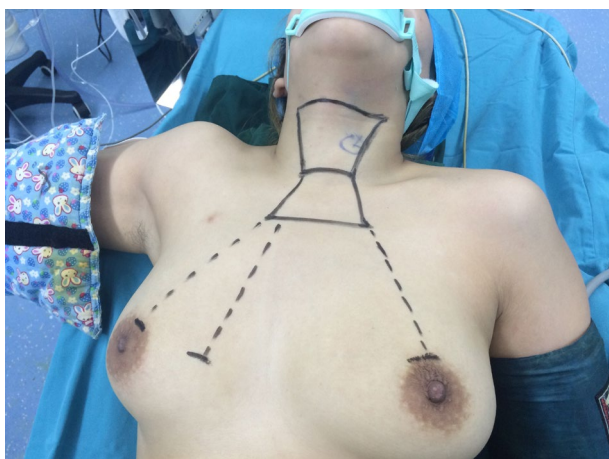
Figure 1 Three trocars position in the chest. Trocar A is aided hole, trocar B is endoscopic hole, trocar C is main operating hole. Cervico-thoracic line region shows extent of free skin flaps during operation.