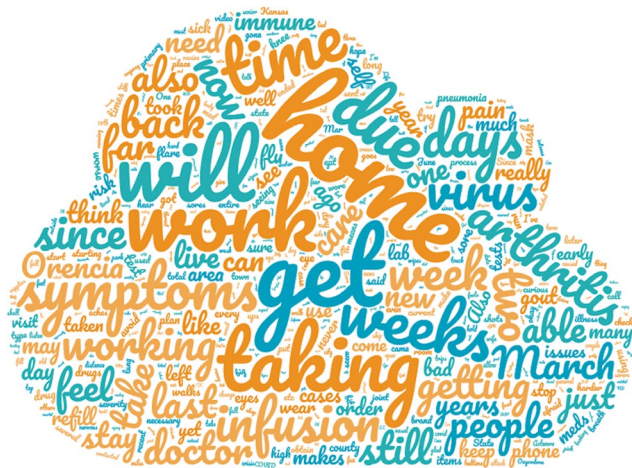
Figure 2. Word cloud demonstrating the top themes and most frequently seen words in respondents’ free-response comments.

In summary, we found that after 2 weeks, many participants in the United States with rheumatic diseases already had important changes to their health care, including canceling appointments, which was independently linked to increased disease activity, and