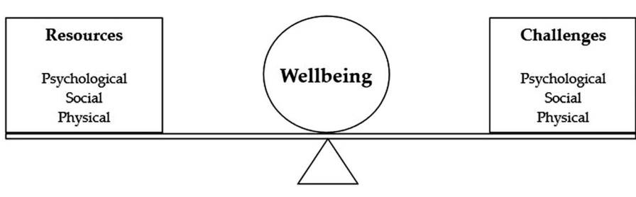
Figure 1. Definition of well-being as proposed by Dodge et al. (2012).