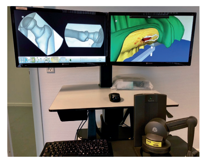
Figure 1. The haptic-feedback virtual reality simulator (TraumaVision, Swemac Simulation AB, Sweden).

of learning). If this holds true, simulation-based LC-CUSUM training programs can facilitate the education of young surgeons, who can safely learn to master the initial steps of the learning curve without imposing risk on patients.