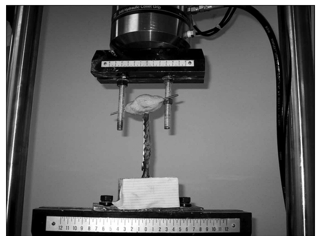
Figure 2. Experimental set-up for torsional test.