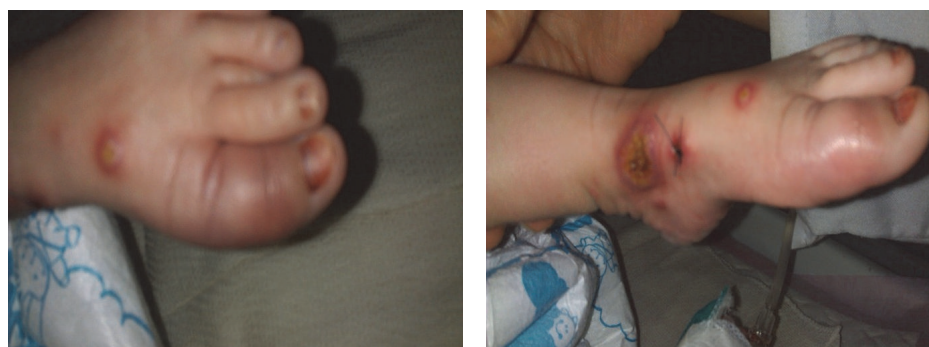
FIGURE 2: Dactylitis in the left foot.