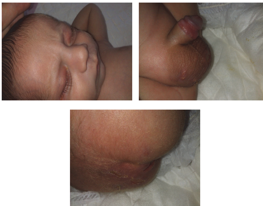
FIGURE 4: lesions after treatment.

then modified it to vancomycin and amikacin when culture results were available.