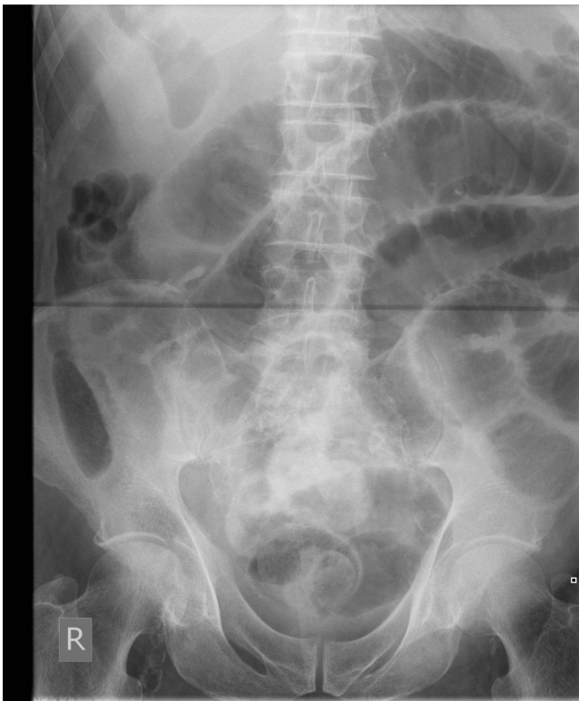
Figure 1 Abdominal X-ray of patient 1 showing dilated loops of small bowel.