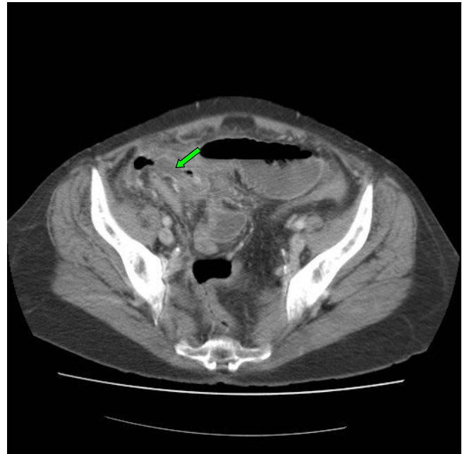
Figure 4 CT of the abdomen of patient 2 showing the inflamed appendix (green arrow).

However, variations of the above mechanisms have been reported. Zissin et al [5] report an unusual case of appendicitis presenting with small bowel obstruction in a patient with intestinal malrotation which was diagnosed pre-operatively by careful analysis of the CT scan, highlighting its use in the diagnosis of bowel obstruction due to appendicitis. Kareem et al [6] presented a case of a patient presenting with a six month history of recurrent partial small bowel obstruction with coexisting appendix