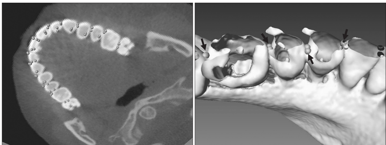
Figure 3. Landmarks represented by arrows on a cone-beam computed tomography (CBCT) slice (left) and a digitally bisected three-dimensional model obtained from the CBCT scans (right) using Avizo software (standard edition version 6.0; Mercury Computer System Inc., Chelmsford, MA, USA).