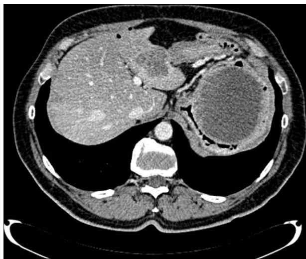
Figure 1. Abdominal computed tomography image prior to treatment with regorafenib (August 2015).

The patient, without KRAS mutation and aged 67, had a wide peripancreatic recurrence of colon carcinoma and liver metastases (Fig. 1). His performance status (PS) was optimal (Eastern Cooperative Oncology Group [ECOG]=0). From April 2012, he had undergone 4 previous lines of treatment with the subsequent use of a cetuximab plus irinotecan-based therapy as first line, another with bevacizumab plus oxaliplatin and 5-fluorouracil as second line, yet another with rechallenge of an anti-EGFR drug such as panitumumab within a clinical trial as third line, and finally a rechallenge of an oxaliplatin-based therapy as fourth line. In August 2015, he began a fifth-line treatment with regorafenib (160mg/die). The blood count with platelets was normal. Liver enzymes showed a small increase as well as LDH levels. The therapy was well tolerated without appearance of hypertension and cardiovascular events with only moderate skin toxicity (hand-foot syndrome grade 1). Continuous monitoring of laboratory tests did not show an increase in amylase and lipase levels nor in liver enzymes or in levels of electrolytes. After 3 months of therapy, the patient presented an unexpected CR with extended reduction of local recurrence of both the tumor and liver metastases (Fig. 2). A sudden parallel decrease in levels of