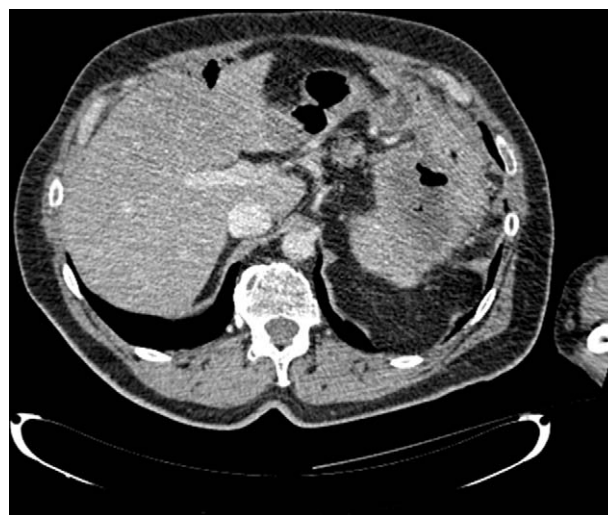
Figure 2. Peripancreatic recurrence of colon carcinoma and liver metastases decreased in size following 3 cycles of regorafenib (160mg/day) (November 2015).

carcinoembryonic antigen was also observed. One year after beginning the treatment with regorafenib, the patient stated to have headache, dizziness, and slurred speech due to the onset of encephalic metastases. Soon after, in September 2016, he died. The possible mutation of KDR , sought with the same methodology as that already described by Loaiza-Bonilla et al, [8] was not found in our patient (Fig. 3).