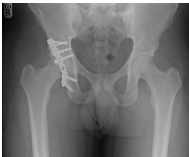
Figure 3 One year follow up radiograph.

In sports, hip subluxation is more common than dislocation indicating the lesser energy involved compared to motor vehicle accidents [6]. The common mechanism in motor vehicle accidents is due to knee hitting the dashboard with the leg in adducted and flexed position leading to a posteriorly directed force on the hip [7]. Letournel and Judet [8] have shown that the posterior acetabulum rim bears the impact of the femoral head with this leg position. The characteristic fractured acetabular posterior lip confirms the force vector and pathomechanism of injury. The indentation of the femoral head also reaffirms this mechanism. With traumatic hip dislocation, prompt reduction is of paramount importance in order to