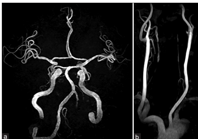
Figure 1: (a) Cerebral magnetic resonance angiography (MRA) shows left vertebral artery (VA) occlusion. (b) Cervical MRA does not depict the right VA orifice.

Nguyen et al. first reported a syndrome of stroke in the posterior circulation after VA occlusion and named this phenomenon “vertebral stump syndrome” after the carotid artery stump and ongoing ischemic events despite the occluded artery. [6] Atherosclerotic stenosis of the VA is most frequently (93%) located at the origin. [5] The prevalence of VASS was 1.4% in patients with AIS in the posterior circulation and one-third of patients with VASS showed recurrence of ischemic stroke in the posterior circulation during hospitalization and poor prognosis. [3] The present case appeared to have been identified just before the onset of AIS with tandem lesions following VASS. The mechanism of VASS appears to be explainable as follows. After the VA is occluded, the distal limit of blood flow can cause propagated thrombus. A low-flow state and persistence of antegrade flow distal to the occlusion due to the collateral circulation may be associated with emboli from the stagnating clot fragment being transported to distal regions. [2,3,6,8] Suzuki et al. reported that spiral turbulent flow