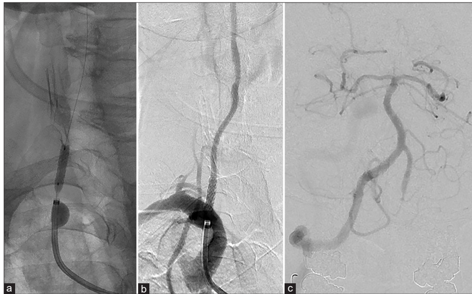
Figure 3: (a) A balloon expandable bare-metal stent is placed at the vertebral artery (VA) origin. (b) Good revascularization is achieved after postballoon dilatation. (c) Intracranial VA angiogram shows good depiction of the posterior circulation without distal embolism.

and antegrade flow were observed on the distal side of the VA occlusion on ultrasonography, which may cause embolization. Turbulent flow can also cause platelet-fibrin aggregation and may theoretically lead to embolization. [8] Abnormalities in the blood flow, hypercoagulability of the blood, and injury to the vessel wall are related to thrombus formation. [2] In this manner, ischemic events from artery-to-artery embolization after vessel occlusion may recur, particularly in the absence