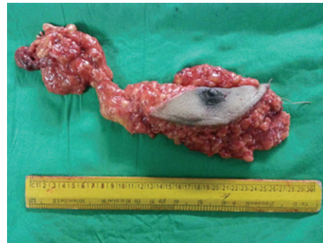
FIGURE 4: Specimen of the completion of modified radical mastectomy with ipsilateral axillary clearance.

receptor positive, HER2 negative whereas most are progesterone receptor positive. This confers good prognosis to this tumour [4].