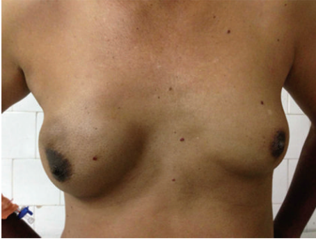
FIGURE 1: Clinical photograph of the right breast showing the mass.