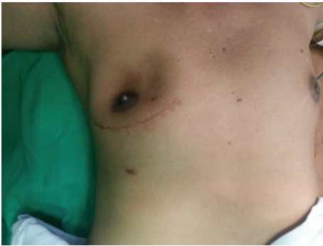
FIGURE 2: Excision biopsy of the lump done through an elliptical inframammary incision.

uneventful. The patient has been followed up for a period of 6 months with no evidence of any local or regional recurrence.