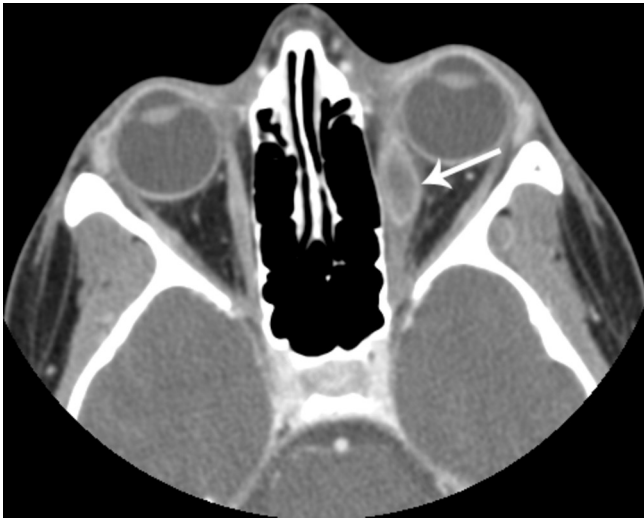
Figure 2 Patient 3. Axial contrast-enhanced orbital CT demonstrates marked swelling of the left medial rectus muscle with a more focal peripherally enhancing mass in the mid-muscle belly (white arrow). There is mild induration of the left retrobulbar fat with slight proptosis.

treatment. Patients with orbital cellulitis usually have high fever and a prompt response to antibiotic therapy. However, they can also have eyelid erythema, ptosis and impaired motor function of one or more extraocular muscles, similar to OM. 3 The differential diagnosis of paediatric OM also includes rhabdomyosarcoma, thyroid eye disease, leukaemia, sarcoidosis, vasculitis, tuberculosis, histiocytosis, ruptured dermoid cyst, arteriovenous malformations and paranasal sinus mucocele. 7–15