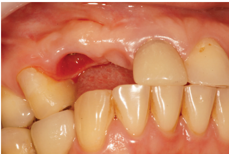
FIGURE 7: Buccal view of the gingival conditioning.