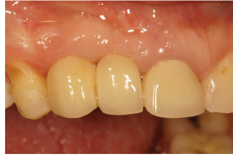
FIGURE 10: Final appearance of the implant prosthesis.

was approved by the institution's Ethics Committee on Human Research and followed the ethical principles of the Declaration of Helsinki, in addition to complying with specific legislation.