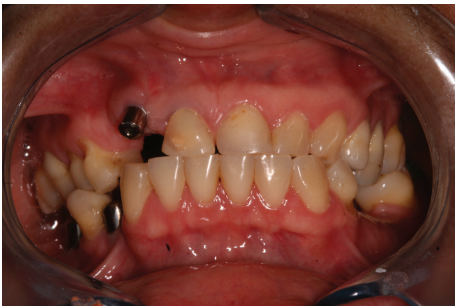
FIGURE 2: Poorly positioned implant.