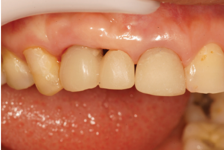
FIGURE 8: Presence of the black triangle before gingival conditioning.