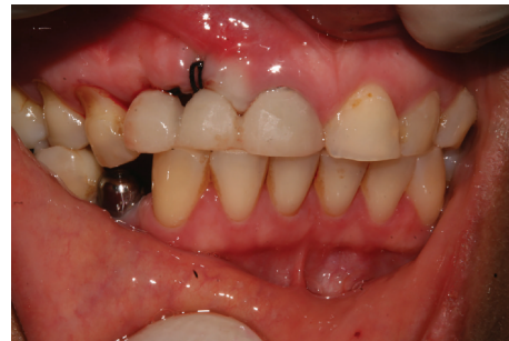
FIGURE 5: Installation of the temporary fixed partial denture.

After the surgery, the removable partial denture was removed. This was followed by the fabrication of a temporary fixed partial prosthesis with retention used during the