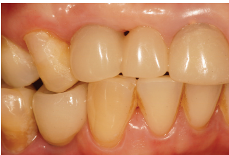
FIGURE 9: Gradual closing of the black triangle.

was approved by the institution's Ethics Committee on Human Research and followed the ethical principles of the Declaration of Helsinki, in addition to complying with specific legislation.