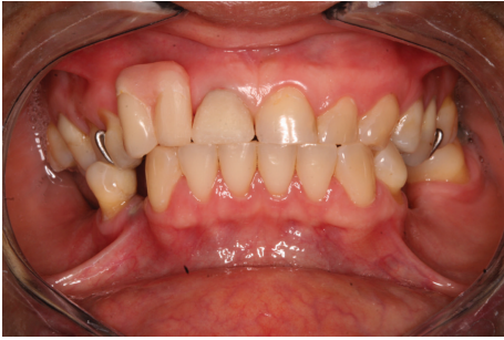
FIGURE 1: Temporary crown on teeth 11 adapted to the removable prosthesis.