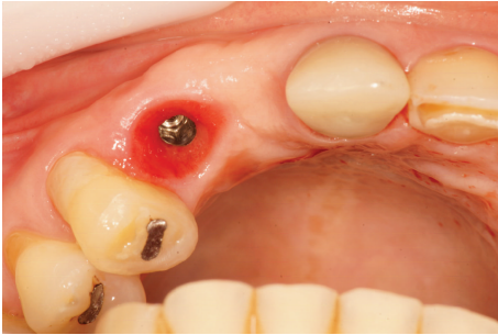
FIGURE 6: Occlusal view of the gingival conditioning.