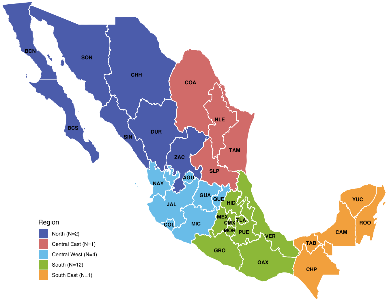
FIGURE 3 Participant distribution across the five genetically diverse regions of Mexico: North, Central West, Central East, South, and South East. One participant is employed in two regions

genetics rather than clinically relevant concepts, and may be taught by non-physician basic scientists (for example a biologist or chemist) rather than a medical geneticist.