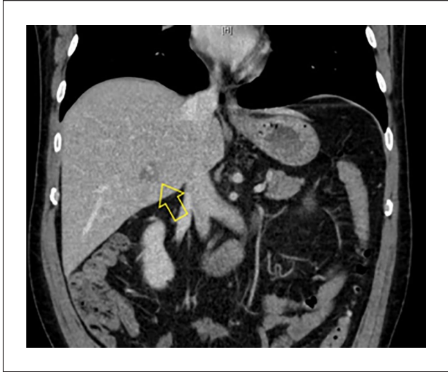
Figure 2. Computed tomography of the abdomen and pelvis demonstrated infiltrative lesion in the right lobe of the liver with thrombosis of the right portal vein.

Three days later, the patient was advised to return to the hospital for admission after 2 sets of peripheral blood cultures grew Bacteroides fragilis . The patient endorsed persistent subjective fevers. Vital signs on admission were as follows: body temperature, 36.7°C; blood pressure, 125/86 mm Hg, heart rate, 113 beats/min; respiratory rate, 16 breaths/min; and oxygen saturation, 98% on room air. Repeated laboratory studies including complete blood count, chemistry panel, and hepatic function panel were notable for a WBC of 8.8 k/ \mu L, AST of 31 U/L, ALT of 108 U/L, and alkaline phosphatase of 593 U/L. Repeat CXR was negative for acute cardiopulmonary disease. The patient was started on intravenous piperacillin/tazobactam. Computed tomography (CT) of the abdomen and pelvis demonstrated (Figure 1) a 6.2 cm × 5.2 cm mass in the posterior segment of the right hepatic lobe with an associated 1.6 cm central abscess. The CT of the chest with intravenous contrast demonstrated focal atelectasis of the right upper lobe with no radiographic evidence of pneumonia. Abdominal ultrasound with pulsed and color Doppler demonstrated normal hepatopetal flow direction of the right, main, and left portal vein with no evidence