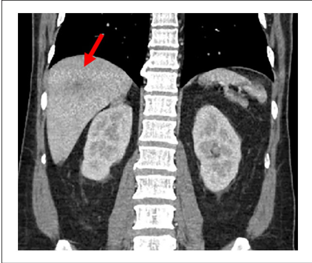
Figure 1. Computed tomography of the abdomen and pelvis showing a 6.2 cm × 5.2 cm mass in the posterior segment of the right hepatic lobe with an associated 1.6 cm central abscess.

count, chemistry panel, and hepatic function panel were notable for a white blood cell (WBC) of 15.0 k/ \mu L with a neutrophilia of 88%, aspartate transaminase (AST) of 185 U/L, alanine transaminase (ALT) of 182 units/L, and alkaline phosphatase of 519 U/L. Chest x-ray (CXR) demonstrated minimal streaky airspace opacity within the right upper lung concerning for developing pneumonia. Peripheral blood cultures were obtained. Severe acute respiratory syndrome coronavirus 2 (SARS-CoV-2) rapid antigen test was positive. The constellation of clinical findings was attributed to COVID-19 pneumonia, and the patient was discharged home on azithromycin and amoxicillin/clavulanate.