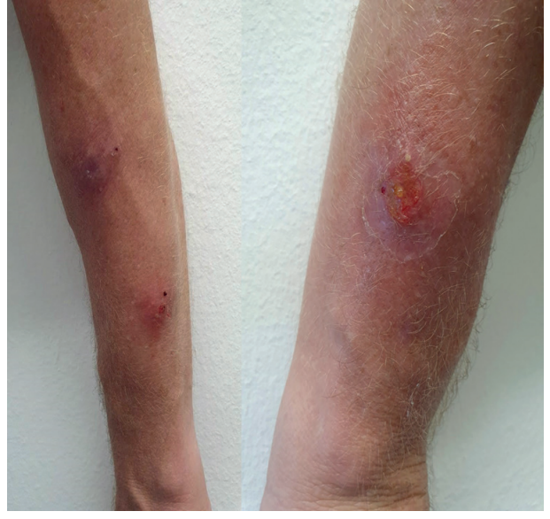
Fig. 1. Reddish-scaly nodules up to 4 cm in diameter with superficial ulceration, draining a putrid secretion on both forearms.

What is your diagnosis? See next page for answer.