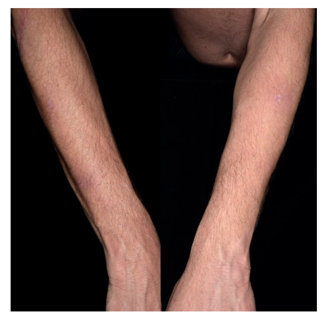
Fig. 3. Almost complete, partially scarred, healing of the nodules on the forearms after antibiotic therapy.

Intravenous therapy with penicillin G (10 mio IU, 3 times daily) for 14 days was initiated. In advance, the patient received oral Jarisch–Herxheimer reaction prophylaxis with 100 mg prednisolone. The therapy resulted in an improvement in skin findings, followed by almost complete healing of the nodules with partial scarring (Fig. 3). Follow-up was scheduled every 3 months during the first year after ending the treatment.