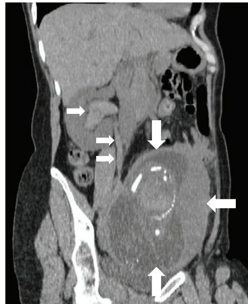
FIGURE 2: Longitudinal CT image indicating hematoma extending to the lower portion of the right ureter (small arrows) and a fetus in the uterus (large arrows).

aPL binding. An in vitro study also indicated that lupus anticoagulant inhibits adhesion and aggregation of platelets, and it is possible that aPL binds to platelets and reduces platelet function [4]. In this case, because thrombocytopenia or abnormality of clotting test was not detected throughout the clinical course, anticoagulation treatment was considered to be the cause of renal bleeding.