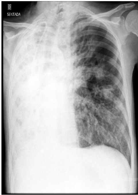
Figure 1 - Chest X-ray showing a diffuse opacity of the right lung that is compatible with atelectasis.

maneuvers, with PEEP values of 20-40 cmH 2 O. A transesophageal echocardiogram was performed and showed no abnormality at the pulmonary vein anastomoses.