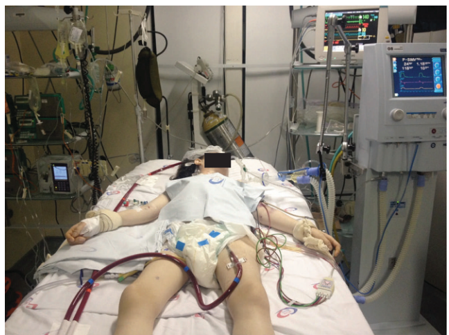
Figure 3 - A patient in intensive care receiving mechanical ventilation and ECMO therapy.

A weaning (autonomy) test from ECMO support was carried out daily. Five days after treatment, the patient presented a PO 2 /FiO 2 of 230 mmHg, and the FiO 2 set was adjusted to 0.6 in the ECMO. The sedation was interrupted, and as patient maintained adequate arterial saturation and a respiratory rate of 20 breaths per minute while in spontaneous mode in mechanical ventilator with FiO 2 of 0.30, she was successfully weaned from invasive ventilation. The patient stayed in ECMO during the next two days in an awake and cooperative state with no pain, at which point she was considered able to have the ECMO support removed. The decannulation was performed at the bedside without complications. The patient was discharged from the ICU after recovering lung function without complications.