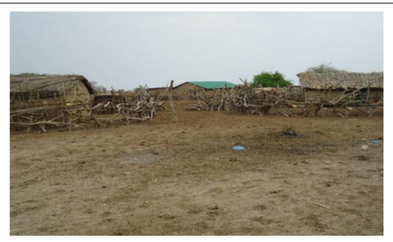
Figure 2 Representation of Maasai community village (Monic village, Ngorongoro district in Tanzania) on the Eastern arm of Rift Valley shared houses with domestic animals during the outbreak.

knew that there was a control measure currently in place that involved vaccination. The level of literacy in the study community was low due to nomadic lifestyle with 37.8% (28) being illiterate, 39.2% (29) standard seven, 5.4% (4) form four, and 1.4% (1) of the respondents being college graduates. This has an impact not only in the transmission and implementation of control strategies for RVF but also in the control of other livestock diseases.