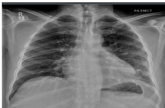
Fig. 2. Chest X-ray six month Postoperative.

et al., reported that high amylase pleural effusion is mostly associated with malignancy, pancreatitis (especially PPF) or esophageal perforation [5]. PPF a complication of chronic pancreatitis has been reported [5]; however PPF association with fungal empyema has not been reported.