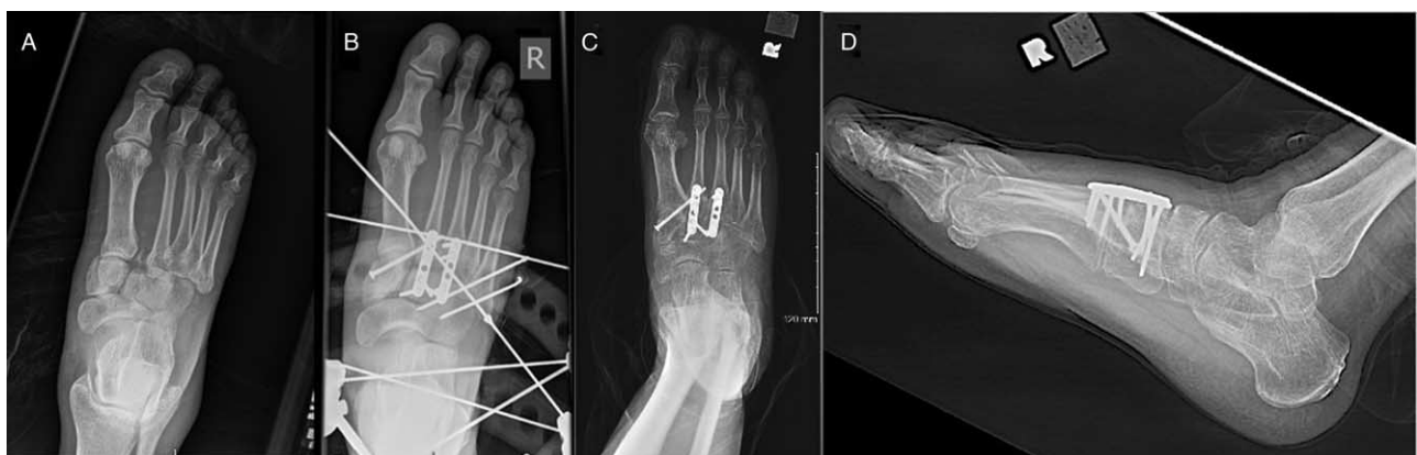
Figure 3. Case 2, midfoot injury. (A) AP x-ray of injury. (B) Postoperative AP x-ray. (C) AP x-ray at 1 year postoperatively. (D) Lateral x-ray at 1 year postoperatively.

A 22 year old male with antisocial personality disorder presented with a right Lisfranc fracture dislocation (Fig. 3A) and a left