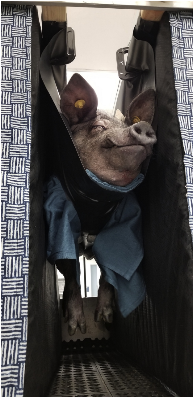
Fig 5. Mini-pig resting in padded sling to maintain non-weightbearing while recovering from anesthesia after surgery.

access the proximal patellofemoral joint and suprapatellar pouch.