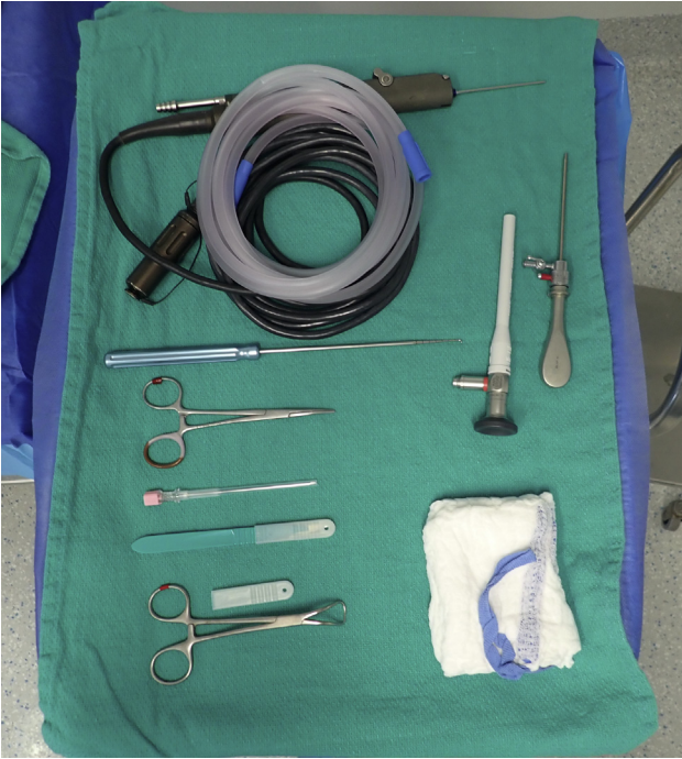
Fig 1. Arthroscopy setup and instrumentation for diagnostic arthroscopy of the minipig stifle (knee).