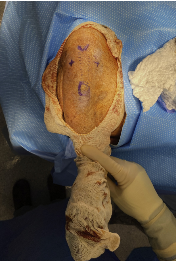
Fig 2. Right minipig knee with marked anterolateral and anteromedial portals (indicated by +) for arthroscopy. The inferior pole of the patella and tibial tubercle are also marked.