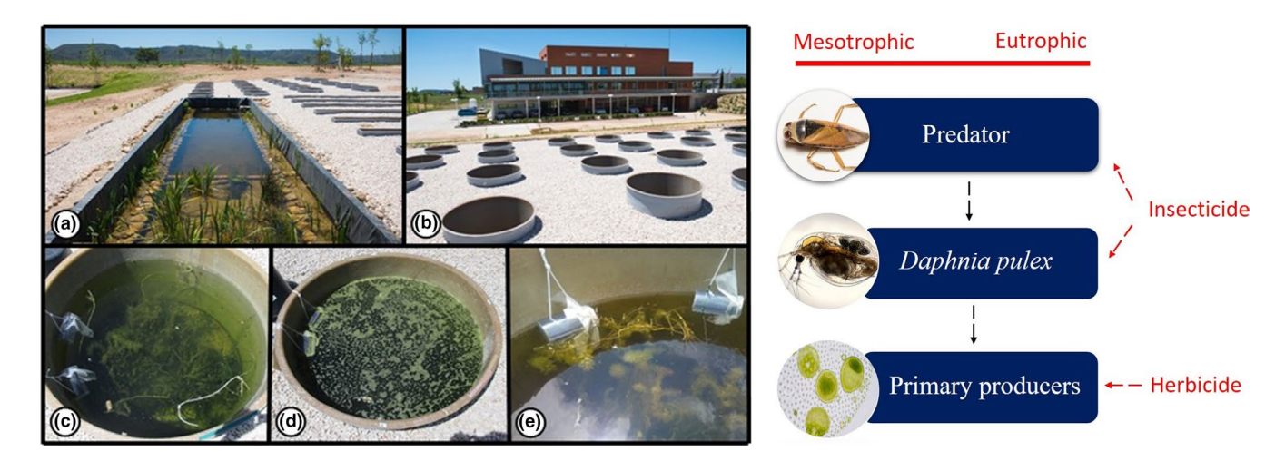
FIGURE 1 Mesocosm facilities (left) and experimental setup (right). Biodiversity lagoon used to fill in the mesocosms (a), outdoor mesocosms (b), mesotrophic mesocosms (c), eutrophic mesocosms (d), detail of experimental cages containing Daphnia pulex alone and Daphnia pulex with one individual of Notonectidae sp (e).

By testing these species and stressor combinations, we aimed to gain mechanistic understanding on the effects caused by multiple stressors on freshwater populations. We hypothesized that direct toxic effects of chlorpyrifos on D. pulex and the indirect effects of diuron caused by a decrease in food availability will decrease D. pulex fitness, increasing its population susceptibility to the predator. Moreover, we hypothesized that the susceptibility of D. pulex will be larger when chlorpyrifos and diuron co-occur, and we expected to see an influence of the trophic status on the response to the single and combined effects of the evaluated pesticides.